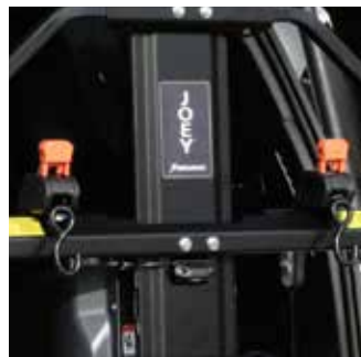
Barrier belt kit* includes two retractable securement straps for added peace of mind. *Required in some vehicles