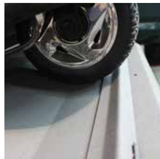
Wheel chock kit required for FWD powerchairs.