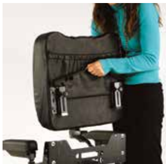
Back-Off easily removes back of mobility device to fit into shorter vehicle openings.