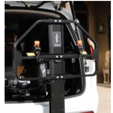
Industry-exclusive safety barrier. Protected by US Utility Patent No. 403.615