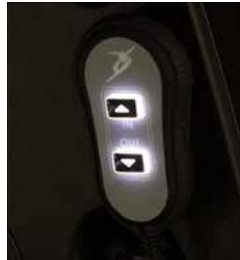
One button control with indicator light.